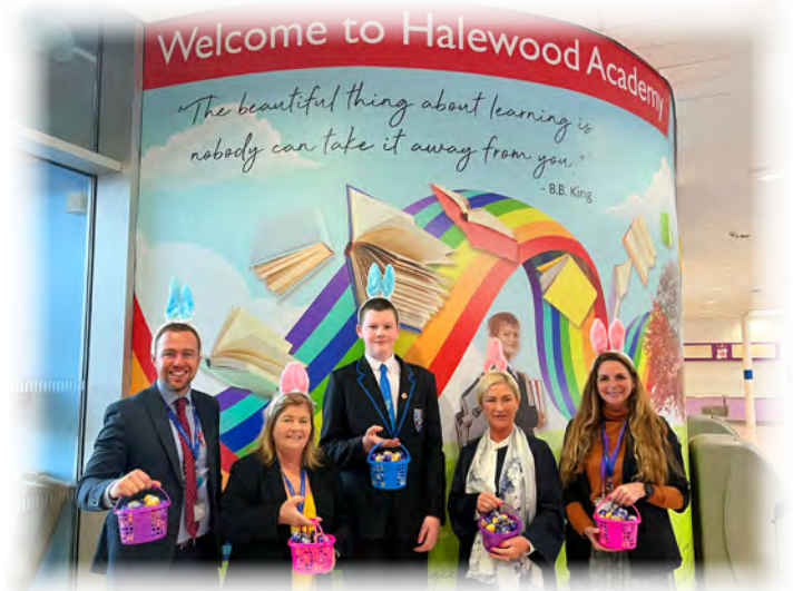
From all the staff at Halewood Academy Happy Easter break to you all!

Finally, many congratulations to students that have excelled in the sporting arena recently both in football, indoor athletics and cross country. A special mention for the Year 9 football team that have progressed through to the highly prestigious ESFA final which is to be played at The Hawthorns (West Bromwich Albion's